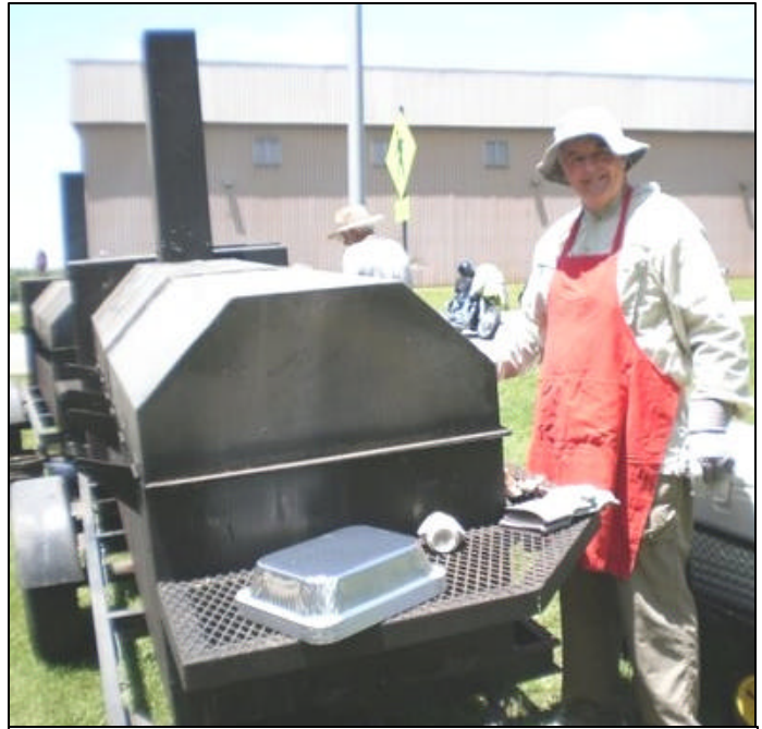
Col. Leghorn stands watch while the Cap'n is away

Since writing this up on the forum, I have spoken with Terry Ware who assures me he keeps an R1100 Hall Effects Sensor unit in stock. Terry also told me that on the R1150's the wiring was rerouted and he knows of no R1150 Hall sensor problems. If you are interested in maybe rewiring your old sensor, I have posted some rudimentary procedures for this on the same club forum thread. Caveat - You are on your own and responsible for your own actions if you go this route and the Outlaw is not liable.